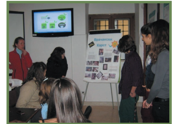
working session with the volunteers, held by Vrachanski Balkan Nature Park Administration