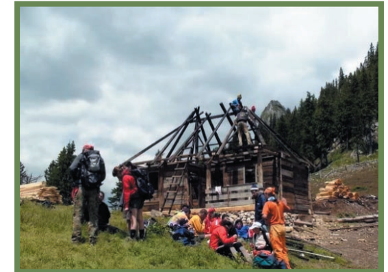
building the new structure