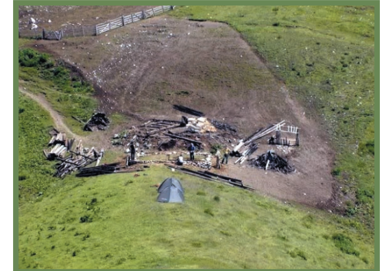
demolishing the old and ramshackle construction