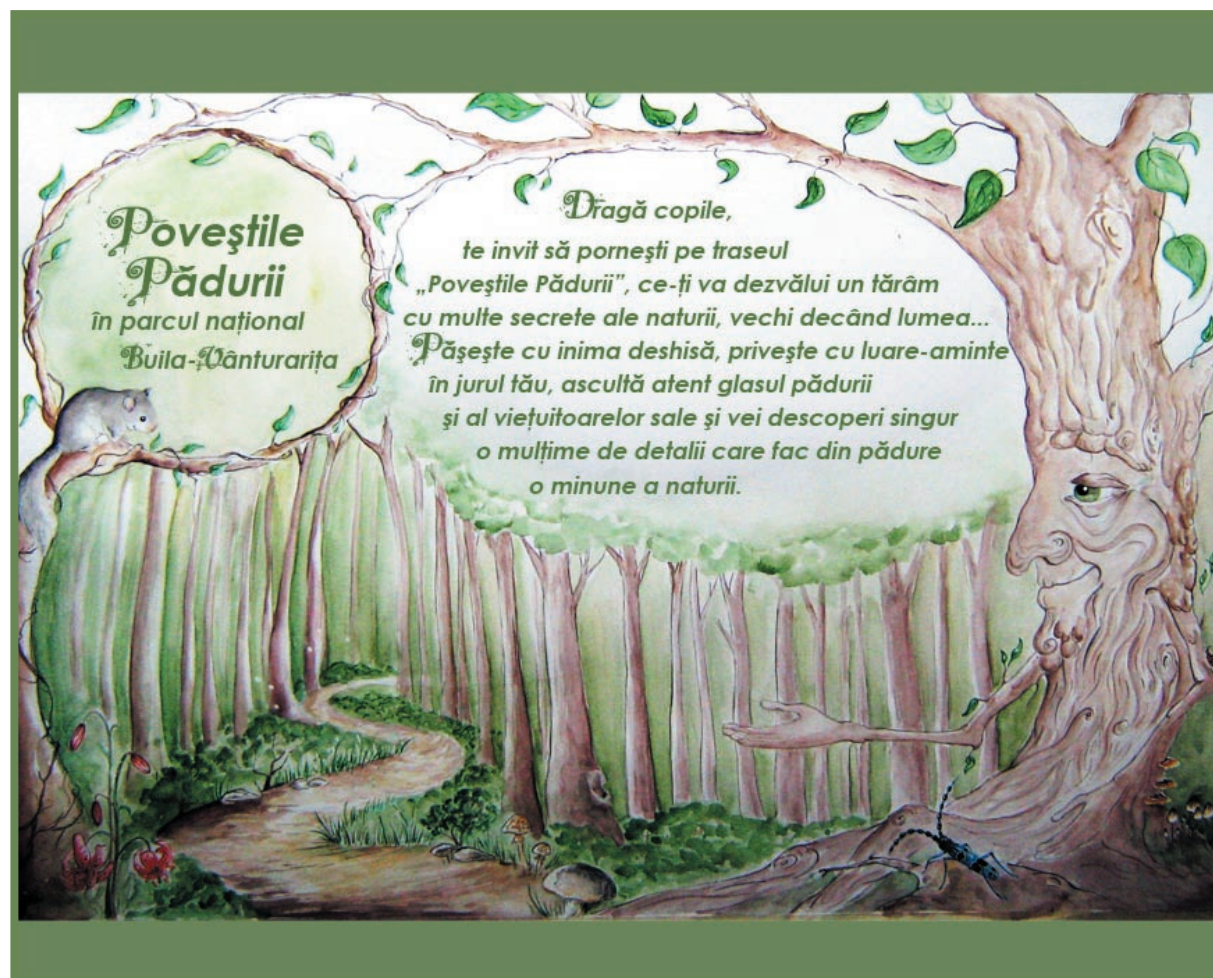
Introduction panel of the nature trail “Tales of the Forest” in Buila-Vânturarița National Park