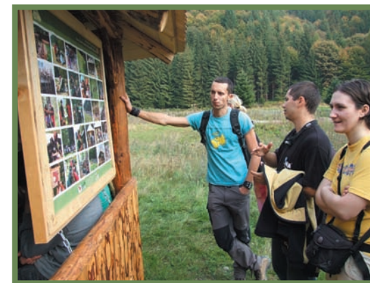
field trip and lecture at the Junior Ranger environmental education wooden tower at Poiana Prislop