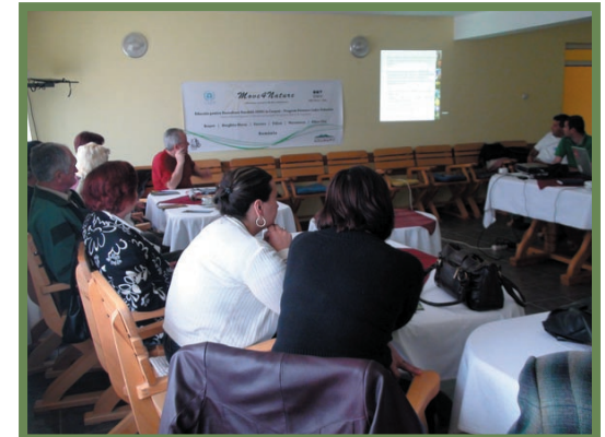
organizing seminars for presentations and involvement of the local teachers in the Move4Nature program