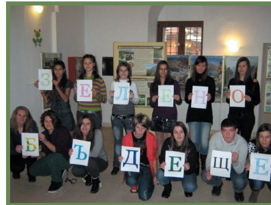
establishing the Green Future Eco-club by Vrachanski Balkan Nature Park Administration