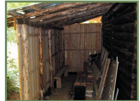
repair and reconditioning works at Codric mountain hut. Buila-Vânturarița National Park