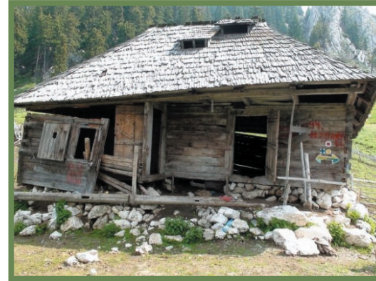
Curmatura Builei mountain shelter before the rebuilding and restoration

This project was implemented with the support of the over 90 volunteers, either independent or representing several organizations (Kogayon Association, ATC Vânturarița-Râmnicu Vâlcea, “Pași Mărunți” Bucharest, Râmnicu Vâlcea Mountain Rescue Service - Salvamont, Romanian Scouts Râmnicu Vâlcea, Caraiman Tourism Club, Râmnicu Vâlcea Technical Forestry College). They helped with the transportation of building materials up the mountain to Curmatura Builei and with building the shelter. During a total of 152 transports/ person each lasting roughly 2h, bare handed or using backpacks the volunteers carried the following: 5,900 wooden shingles, 450 wooden boards, 100 kg nails and other necessary materials.