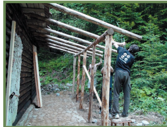
repair and reconditioning works at Codric mountain hut. Buila-Vânturarița National Park