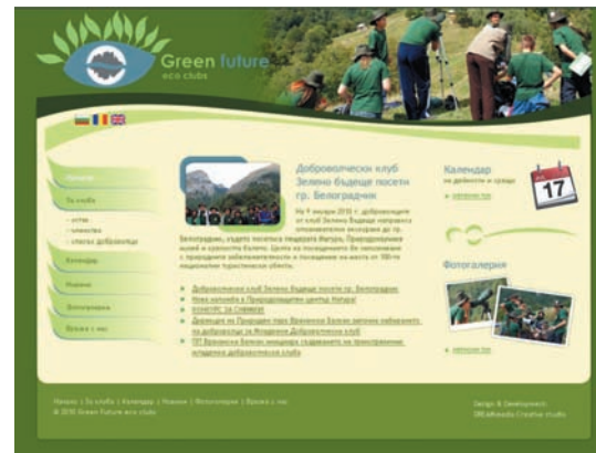
the web platform for communication between the volunteers and dissemination of the results www.greenfutureclubs.com