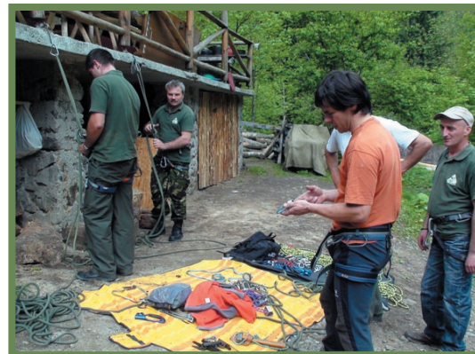
training for the APNBV staff