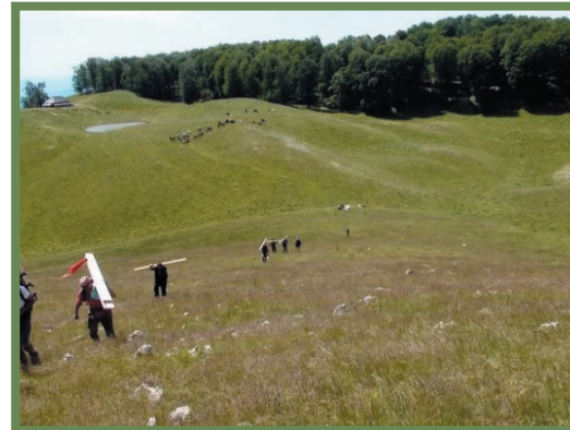
“transportation” of the new materials up the mountain

The result is a mountain shelter permanently open for tourists, with a capacity of 20 places in bunk beds, in two rooms (3.5x3 m and 3.5x4.5 m) and a porch (3.5x1.5 m). Inside the shelter a small information spot was created, where visitors can use the touristic guide and map of the park and other informative material. We also prepared a guestbook and questionnaires for tourism monitoring that visitors can fill out, thus helping to improve the touristic infrastructure inside the park.