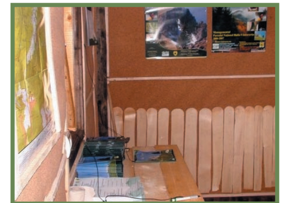
setting up a small “tourist information corner”, containing: leaflets, brochures, tourist questionnaires and a large scale map of the National Park