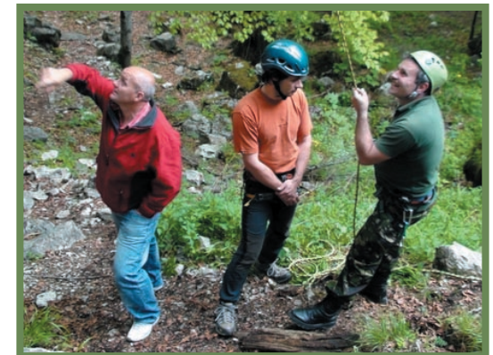
training for the APNBV staff