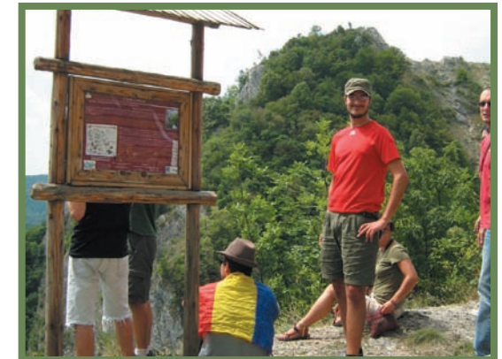
volunteers that helped with the maintenance of the tourist guiding signs and panels in Buila-Vânturarița