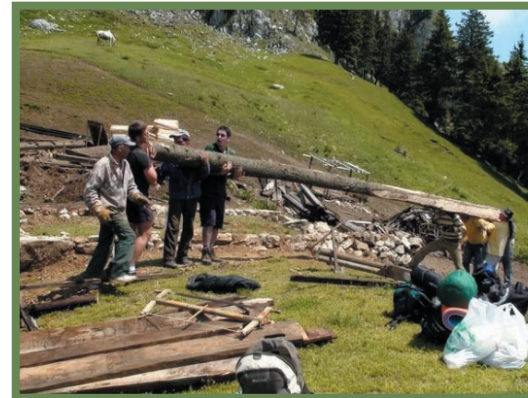
selecting materials that were still in a good state to be reused for the new construction