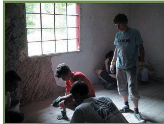
repair and maintenance work inside Codric mountain hut. Buila-Vânturarița National Park

During the summer of 2009, a group of 5 Italian volunteers (from Cooperativa Sociale ONLUS, Brescia, Italy) also joined the Belgian team and Kogayon members.