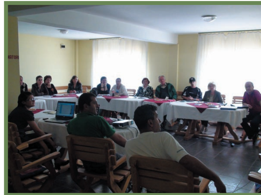
organizing seminars for presentations and involvement of the local teachers in the Move4Nature program

The project aimed to provide training for the park administration personnel on climbing gear and techniques, on giving first aid and on participating in mountain rescue activities.