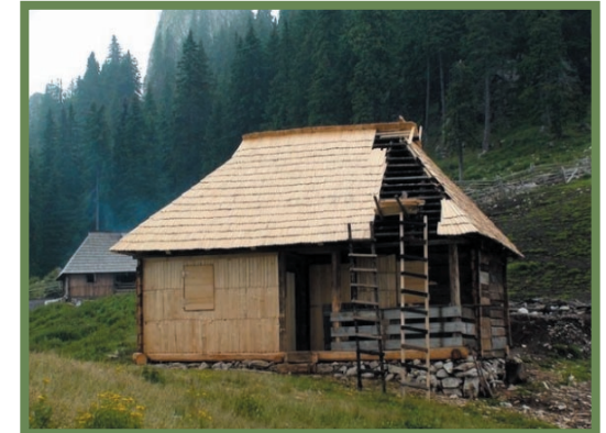
...almost ready, the last day of working at the roof