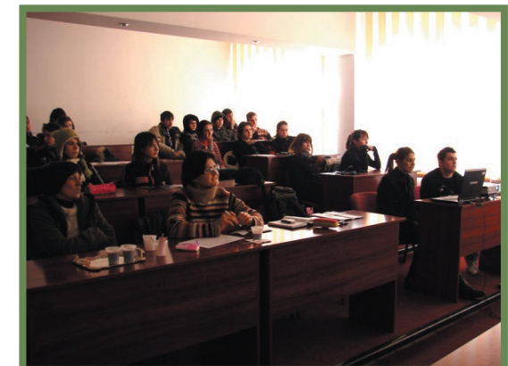
presentation session for selecting the local Romanian volunteers of the Eco-club. Horezu Highschool