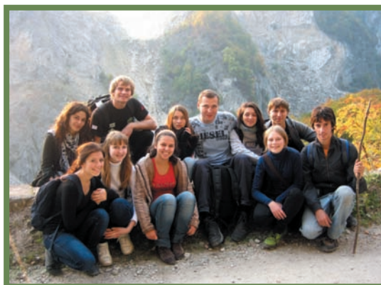
field trip on the Ecotourist Trail Buila-Vânturarița National Park