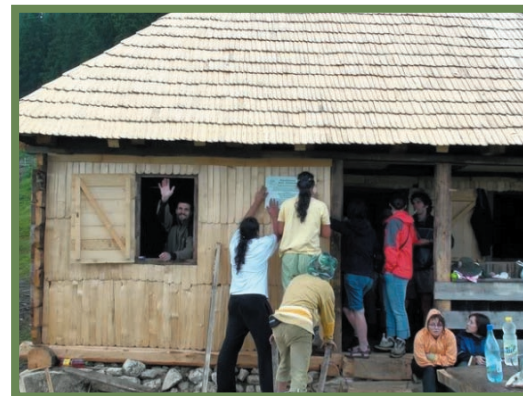
finishing last details and putting up a “thank you” plaque