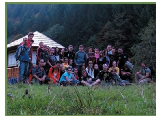
the young participants from the 6 countries of the programme. Poiana Prislop. P.N. Buila-Vânturarița