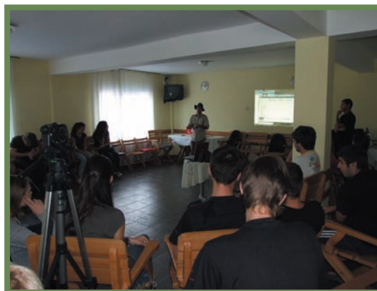
presentation and workshop focusing on protected areas management. Study case: Buila-Vânturarița National Park